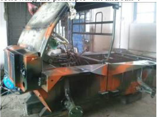
Fig. 3 Mobile platform (technical revision)

- light rocket launcher capable to act following the principle "hit and run".