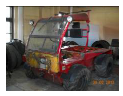
Fig. 2 DAC 2.65 FAEG

Only five units were made and another two ones as empty bodies. Two of them have Wankel rotary engine (probably identical to the CROCO/RHINO engines). Another unit has Fiat Panda 1,4 liters engine and other two were made using Dacia 1400 cmc, 65 HP, engine. Only one from the last two ones is still functioning and all the following details refer to this one (Fig. 2).